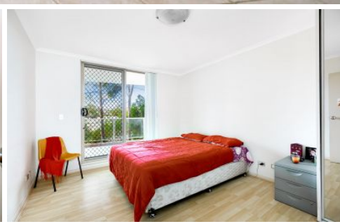
5/14-16 Station Street Homebush NSW

If value buying is what you are after then look no further. Centrally located, close to Homebush station, schools, parks & local shopping this property presents a superb home for young families, professionals and astute investors.